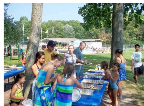
No one left the picnic hungry

As promised, this season's final special event for our residents was a resounding success for the more than 800 Morris Township residents who attended.