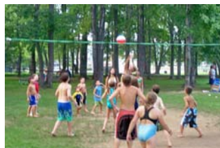
Lots of fun and games kept everyone busy throughout the afternoon